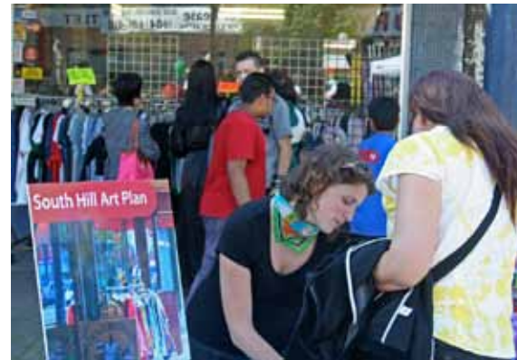
7th Annual South Hill Festival, 2009

was provided about the rationale for the SHBIA's development of a public art plan; a draft of the program's goals and objectives; and examples of local and international public art projects. The kiosk was very busy for the duration of the Festival. Contact was made with approximately 200 people.