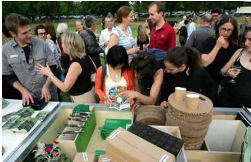
Public Works, Park Products, London, UK 2004 A mobile "market stall" is set up to trade hand-made products for tasks done to clean up and improve the park.

South Hill is a culturally, generationally and economically diverse neighbourhood with complex patterns of relations between individuals, businesses and communities. Many educational and social services are offered expressing the supportive and collaborative spirit of the area and its diverse residents. The daily exchanges of people in the area present opportunities to initiate dialogue and community participation through a growing pattern of events.