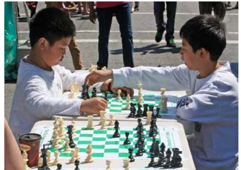
7th Annual South Hill Festival, 2009

Artists have the opportunity to explore rhythms of movement and rest while creating spaces that invite social interaction. Projects focus on activating the unique and often hidden urban spaces of South Hill such as the parking lots, alleyways and side streets. These active urban spaces draw people out of their daily habits to rediscover their neighbours.