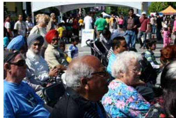
7th Annual South Hill Festival, 2009

For the second consultation, the SHBIA hosted a community meeting at John Oliver Secondary School in the historic "barn" on June 8th, 2009. Cole Projects provided an in-depth power point presentation that outlined the goals, and the themes accompanied by related public art projects. Through guided questioning, feedback was gathered to further inform the Art Plan.