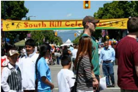
7th Annual South Hill Festival, 2009

Public spaces are places where we enact our social values. Public art reflects these values and acts as an agent for interpretation, negotiation and expression of those things that are considered significant to a community. With foresight and conviction, the South Hill (Fraser Street) Business Improvement Association (SHBIA) initiated a planning process to bring an exciting program of art in public spaces to a relatively un-noticed area of South Vancouver. They envisioned their neighbourhood of South Hill as a site of rejuvenation and celebration, one that would draw upon its diverse communities to reflect upon their shared and individual experiences of this unique place.