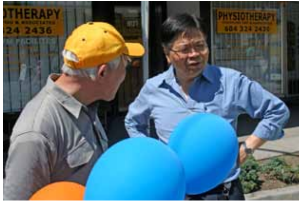
7th Annual South Hill Festival, 2009

from South and East Asia and Western Europe established the area ensuring its continued growth. After the Second World War, housing, schools and community facilities were developed to accommodate veterans and their families. South Hill's agricultural landscape was slowly transformed into the busy urban neighbourhood of today.