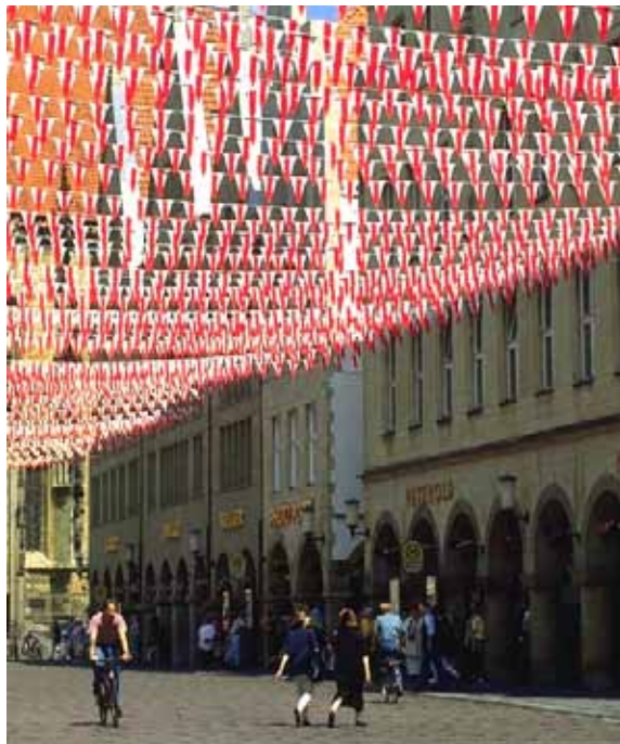
Daniel Buren, Pennants in Münster, 1997

South Hill’s diversity presents itself in the rich accumulation of lines, shapes, colours and textures in fluctuating compositions. This cacophony of visual elements encompasses intersections, sidewalks, boulevards, walls and storefronts. The visual richness of the streetscape presents opportunities for artists to explore a diversity of visual motifs while contributing to a strong cohesive visual identity for Fraser Street. As these projects unfold over the years a rich urban fabric will be woven.