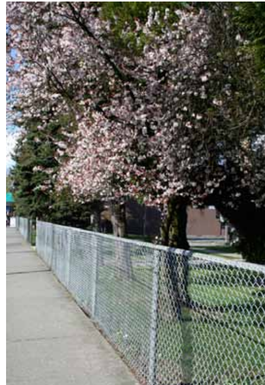
Fraser Street, 2009