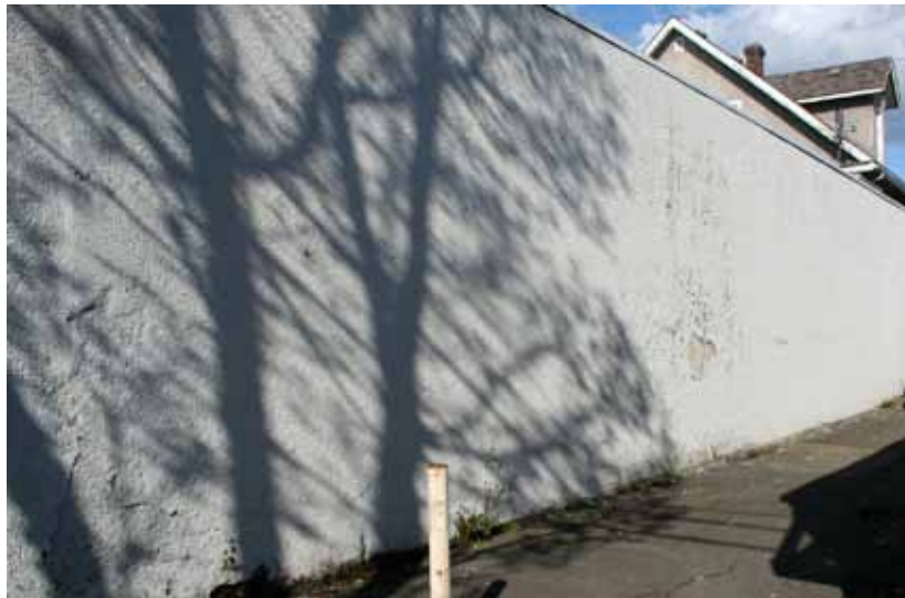
Fraser Street, 2009

Everyone felt that South Hill's 100th anniversary was an important event to celebrate. Some participants were concerned that many South Hill residents may not relate to the early history of Fraser Street. They feel it is important for the people of the area to see themselves in any projects related to the anniversary and therefore they should celebrate the past and the present.