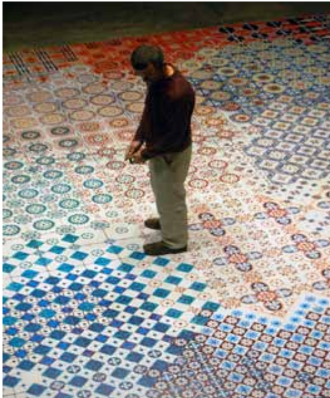
Michael Pinsky, Horor Vacui, Portugal, 2007 A database of tile motifs is used to create a large scale puzzle in the central plaza of Torres Vedras.

“Art is the imposing of a pattern on experience, and our aesthetic enjoyment is recognition of the pattern.” 4