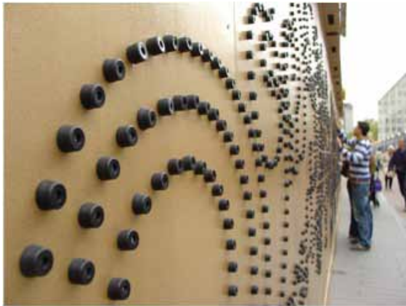
Alete Castelo & Melissa Mongiat, Gamelan Playtime, London, UK, 2006

Fraser Street is a major thoroughfare with a steady flow of street traffic - pedestrians and cyclists moving to and from the area form habitual patterns of movement and rest. There are opportunities to create new patterns of engagement in the neighbourhood by providing spaces for conversation, play and leisure. These delightful diversions invite people to slow down and discover the unique, often hidden spaces of South Hill.