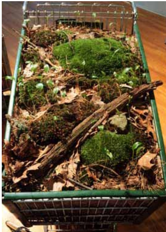
Bell Vaughn, Portable Forest, Seattle, Washington, US, 2003

South Hill has the potential to support a rich urban eco system that makes it possible for residents to connect with seasonal patterns of growth and harvest. Fraser Street's well-established trees are accompanied by small but promising green spaces. The intersections have corner beds well tended by local residents, the side streets have stretches of green grass and the parking lots are edged with large shade giving trees. These sites invite residents to come together and become actively involved in the renewal and improvement of South Hill.