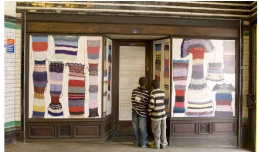
Wimbledon College of Art & Morden Women's Institute, Knitting Circle, Underground Art program, London, UK, 2007

The knitting shown here resulted from a making process where each piece was passed through the circle, each person contributing only a segment. The resulting knitted lengths are a detailed physical chart of the time the groups spent together.