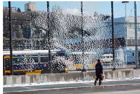
Christian Moeller, News readers, 2006

Artist projects will respond to the textile traditions of multiple cultures reflecting the shifting demographics of South Hill. Textile patterns from cultures such as Chinese, Punjabi, Iranian and Filipino offer strong lines, colours and shapes to form a larger urban fabric that references the pattern and randomness, the unity and difference of all communities. Pattern inspired artworks will be applied to many different surfaces including walls, streets, and fences along Fraser Street. They will also encompass textile-based surfaces such as banners, pennants, and awnings.