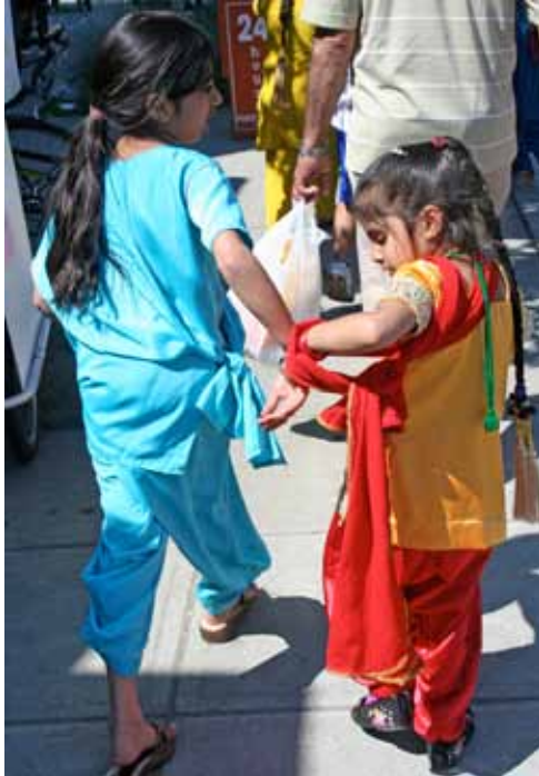
7th Annual South Hill Festival, 2009

The South Hill Public Art Plan should be considered and used as a “living document”, one that evolves and expands as needed. It provides a framework for the commissioning of a series of artworks that will unfold over an 8 to 10 year period. It was written with the understanding that public art inspires conversations and it is our hope that from the beginning stages of planning and consultation all the way through to artwork installations, the South Hill Public Art Program is approached as a participatory experiment.