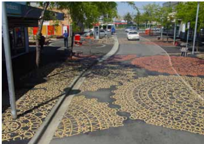
Duratherm, Morwell Streetscape, Australia

Engage the expertise of an art consultant to fine-tune budgets, assist with fundraising, define the artist terms of reference and manage a selection process to commission a lead artist 5 . The lead artist will act as both artistic director and project manager for this series of projects. This role will ensure a cohesive and integrated series of striking artworks that provide a strong visual identity for Fraser Street.