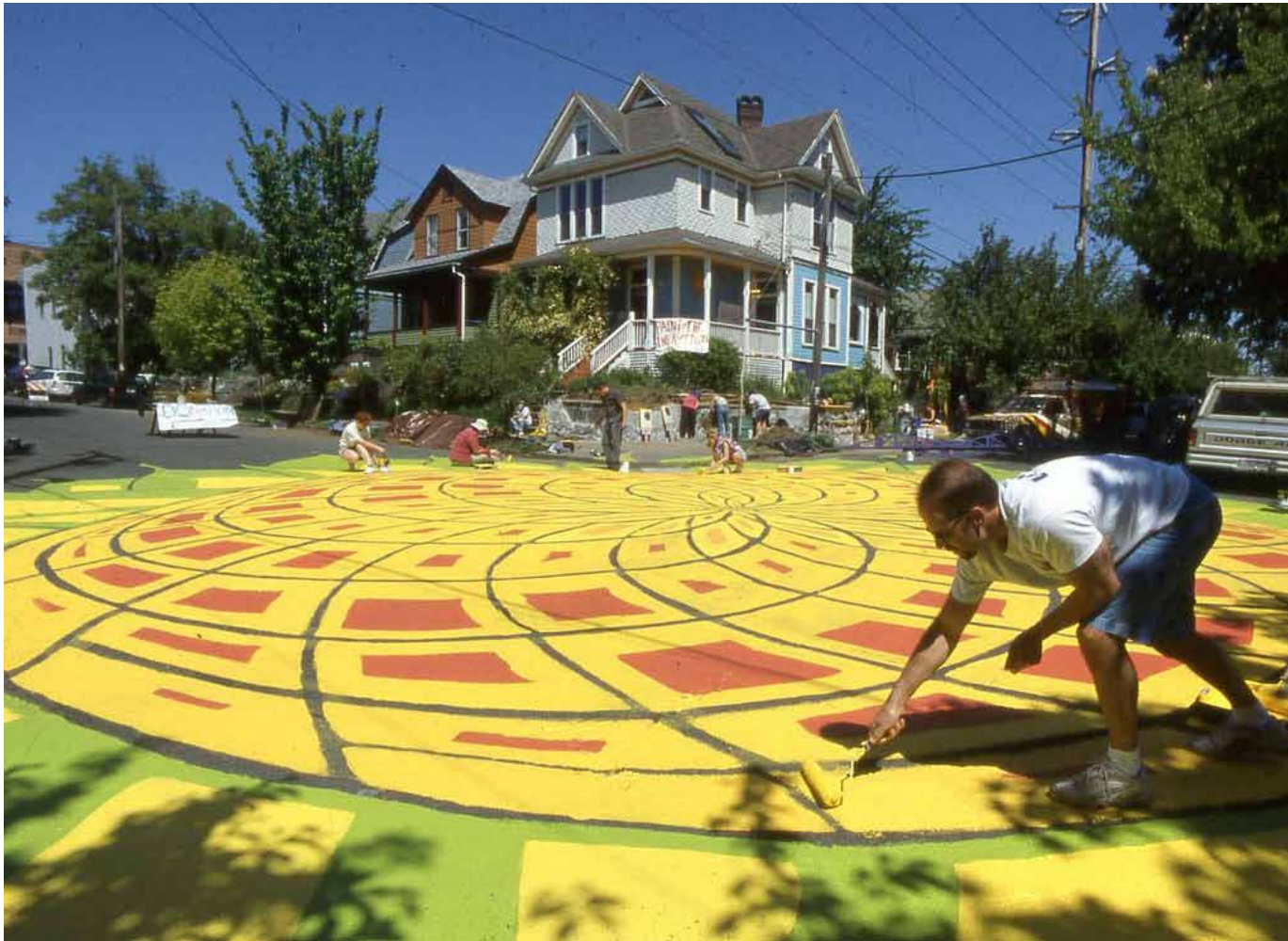
City Repair, Sunnyside Piazza, Portland, Oregon, US, 2009