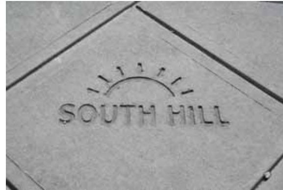
Fraser Street, 2009

Throughout the consultation process a strong sense of commitment to the Public Art Plan was expressed. Those that live and work in the area recognize the uniqueness of Fraser Street and want a Public Art Plan that shares their appreciation of South Hill. The process led to the identification of the following goals and objectives for the Art Program.