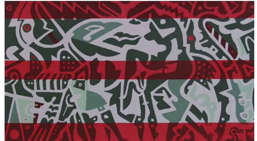
Eric Metcalfe, Voodoo, 2002

Whether it is a piece of music, a poem, or a painting, pattern is one of a number of art elements that provides the underlying structure of a composition. Recognizing the South Hill Public Art Program will take a number of years to unfold and engage the efforts of many different participants, we suggest the unifying concept of ‘pattern’ to act as a framework for the gradual building of a cohesive collection of artworks.