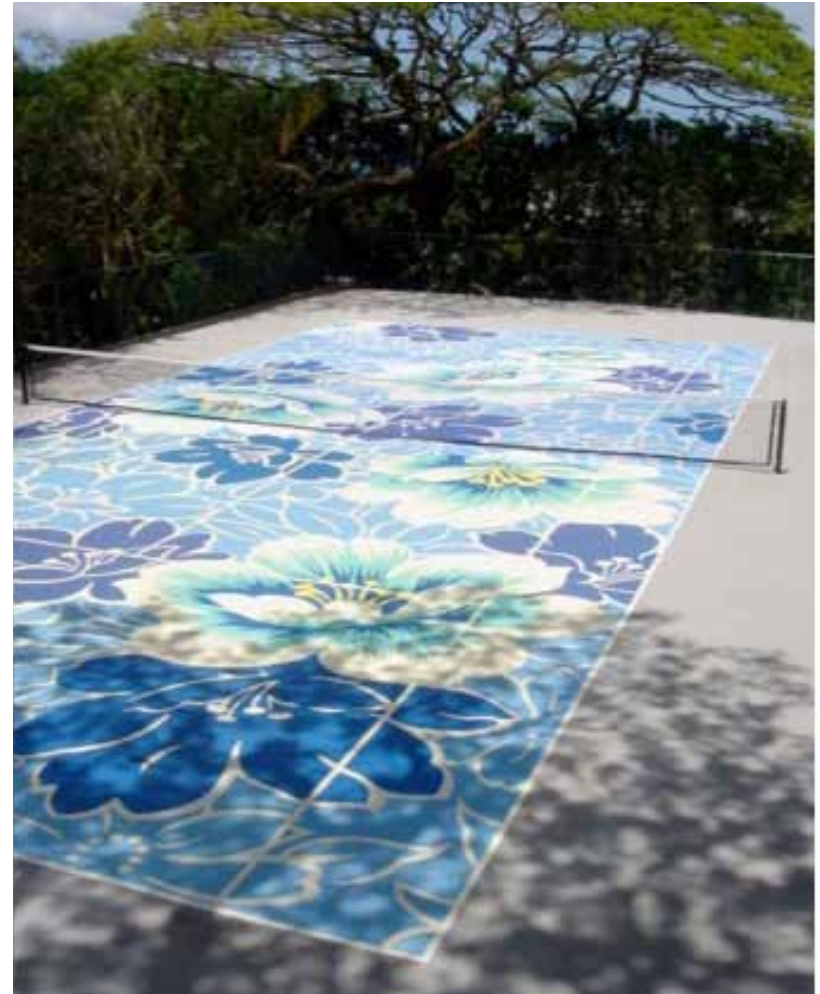
Michael Lin, Tennis From Above, The Contemporary Museum Honolulu, US, 2005

This project is comprised of a number of components. To realize the complete vision, the recommended budget range is $95,000 to $100,000 to cover all artist fees, materials, fabrication and installation costs.