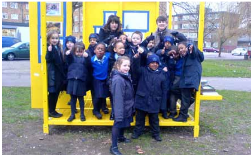
Public Works, Granville Cube, 2005-2007 This mobile structure was moved from place to place and used for activities programmed by artists.

Active artistic collaboration with businesses and communities will create opportunities for dialogue and participation towards broad social change. These projects will culminate in a new community platform for planning the next steps for South Hill's Fraser Street.